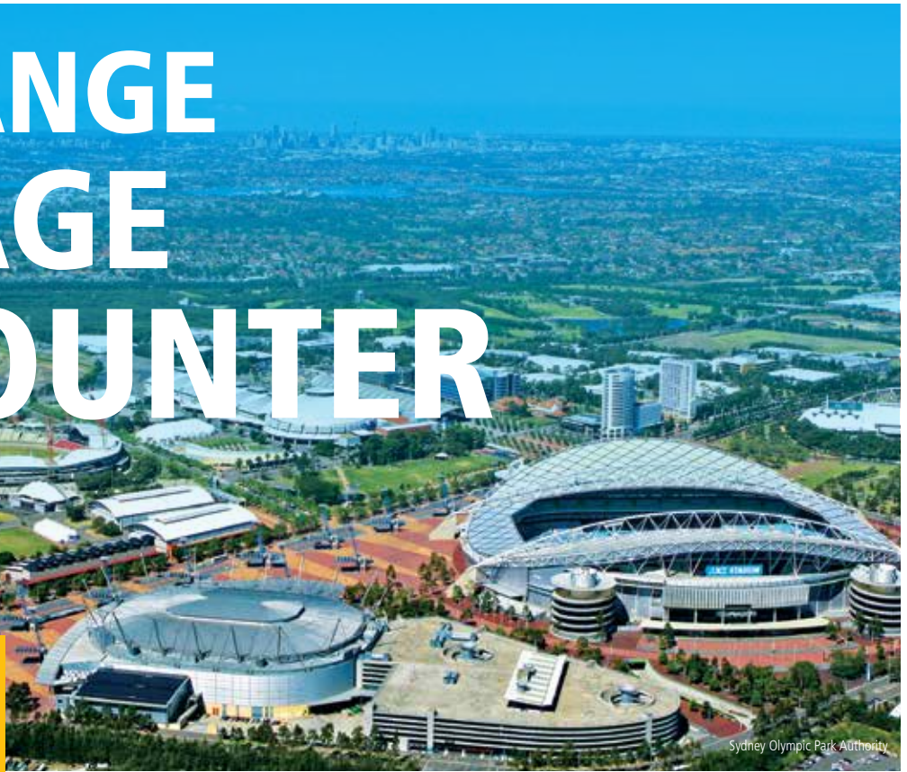
Sydney Olympic Park Authority