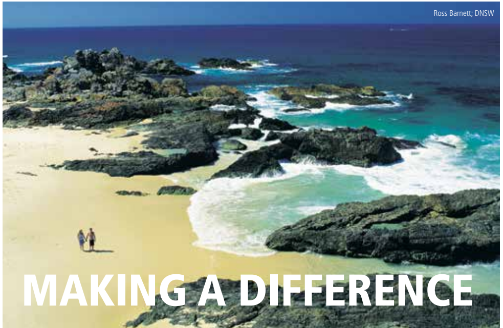
Ross Barnett; DNSW

A comparatively small Rotary country, with 34,000 Rotarians in 1,164 clubs and 22 districts, Australia was nevertheless the eighth-largest contributor to The Rotary Foundation in 2011-12, giving US$6,021,725. However, The Rotary Foundation is just one of numerous major programs that Rotarians in Australia support through service and funding.