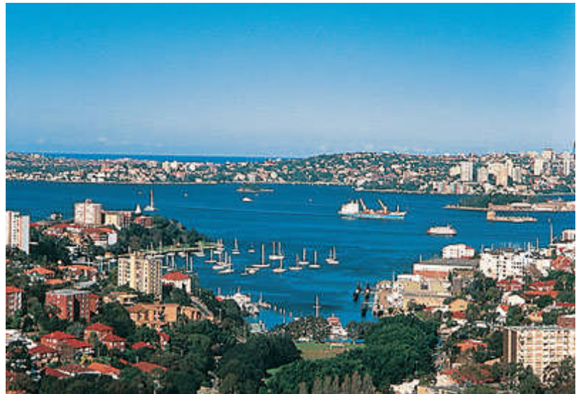
Rydges North Sydney has both harbour and park views.