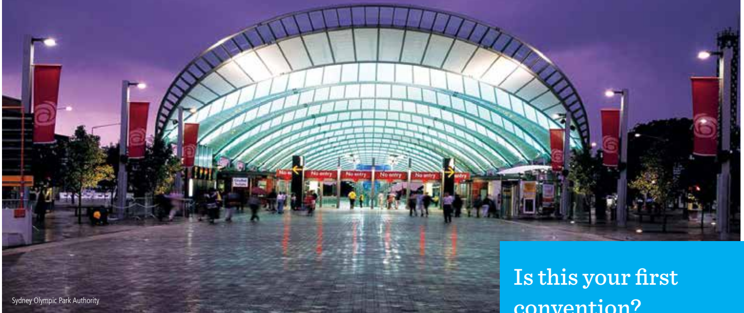
Sydney Olympic Park Authority

Stay up-to-date on convention news with the free RI Convention Update e-newsletter. Sign up at www.rotary.org/newsletters .