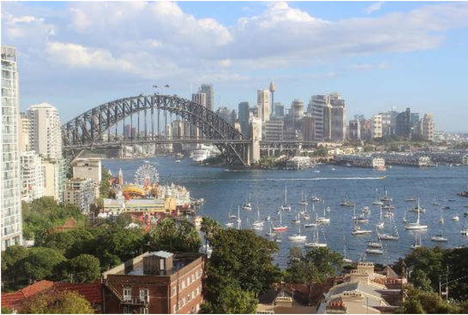
A typical view from the North Sydney Harbourview Hotel

Website for VIVID Light Show: www.vivid.sydney.com/ Vivid, a festival of light music and ideas.