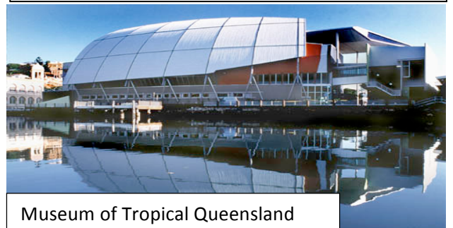
Museum of Tropical Queensland

What are you waiting for? Come and experience the hospitality of Northern Queensland