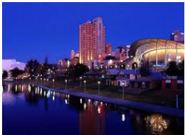
City skyline by night